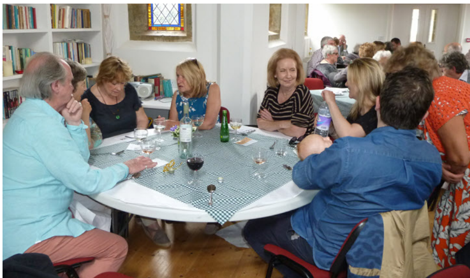
Salmon Lunch in the Old Chapel for Oxhill's Gala Weekend