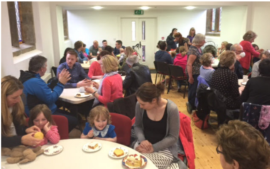
Tea and Cake on the Saturday in the Old Chapel

We hope everyone who supported the Oxhill Gala Weekend were able to enjoy this first attempt to try a joint event which was a bit different from last year's event and in spite of the weather. (A game of cricket did happen after the rain stopped.)