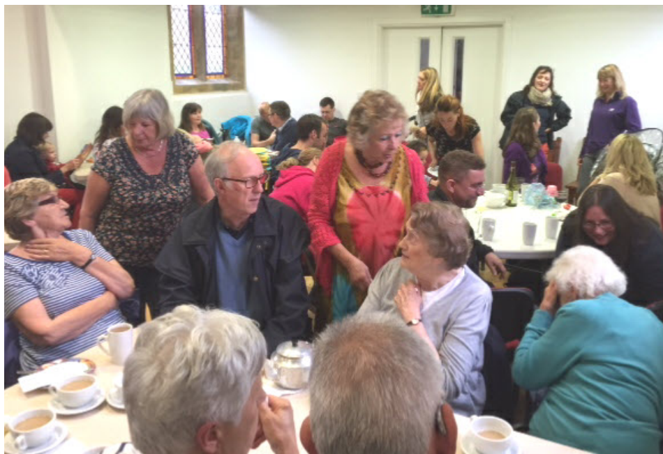
Friendly conversation and cups of tea