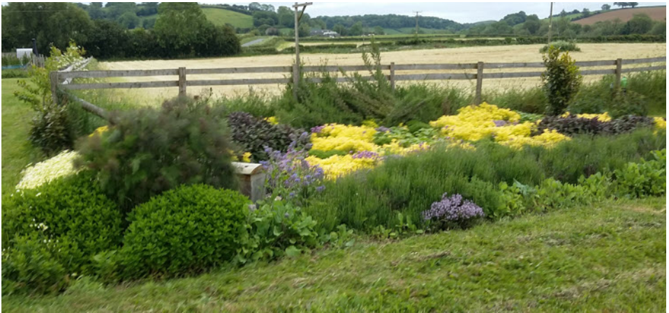
The Sensory Garden

The Bee Team have been busy making more frames for the hives and have installed a third hive of bees. They bees settling in and the sensory garden, which is looking truly splendid, is a first stopping point for food before they move further afield.