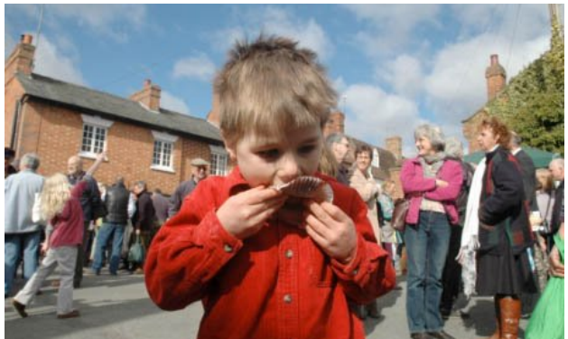
Kineton Farmers Market 2014

Kineton Farmers Market will be held on Saturday 11th July and Saturday 12th September from 10:00-12:30 in the Market Square, Kineton.