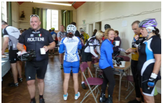
Shakespeare Bike Ride feed stop at the Village Hall 2014

Secondly, we need people to marshal on the route to help keep the cyclists safe. If you can help in this way, please contact Lily on 01789 266852 to find out more.